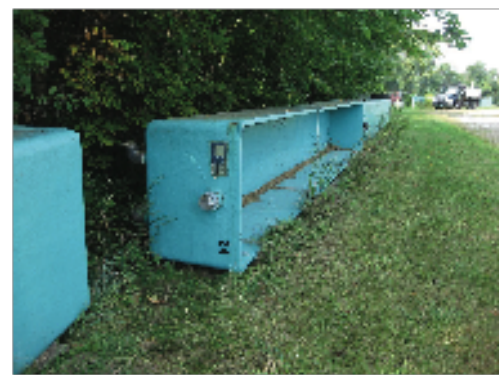
We will use these fiberglass and wood raceways for the arms of the maze.